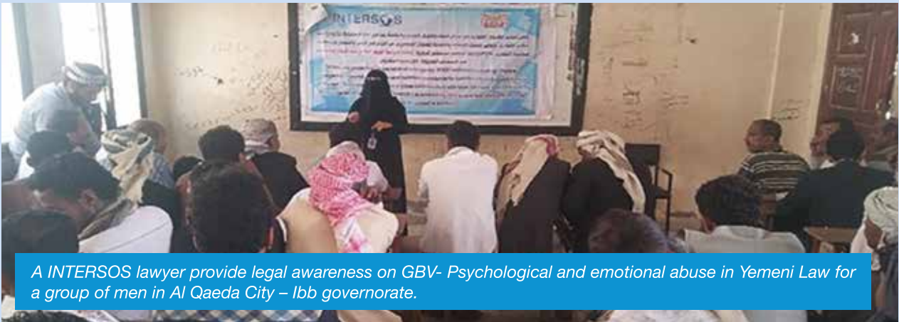
A INTERSOS lawyer provide legal awareness on GBV- Psychological and emotional abuse in Yemeni Law for a group of men in Al Qaeda City – Ibb governorate.