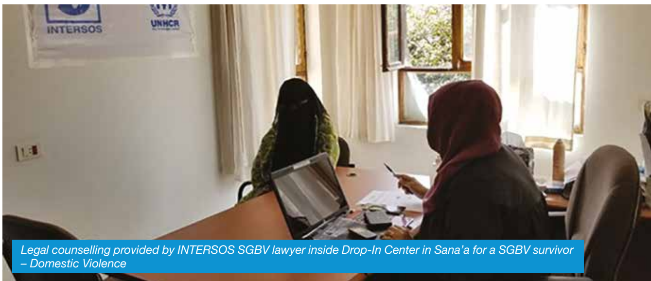
Legal counselling provided by INTERSOS SGBV lawyer inside Drop-In Center in Sana'a for a SGBV survivor – Domestic Violence

The Global Compact on Refugees, affirmed by the United Nations General Assembly in 2019, put in place a new comprehensive refugee response model. One principal mechanism for follow-up and review is the Global Refugee Forum where States and other actors come together every four years to share good practices and contribute with pledges of financial support, technical expertise and policy changes to help reach the goals of the Global Compact. The first Global Refugee Forum took place in December 2019, and INTERSOS pledged to conduct a lessons learned research on provision of legal aid based on operational experiences from different operational contexts.