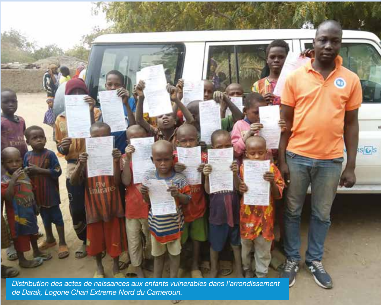
Distribution des actes de naissances aux enfants vulnérables dans l'arrondissement de Darak, Logone Chari Extreme Nord du Cameroun.