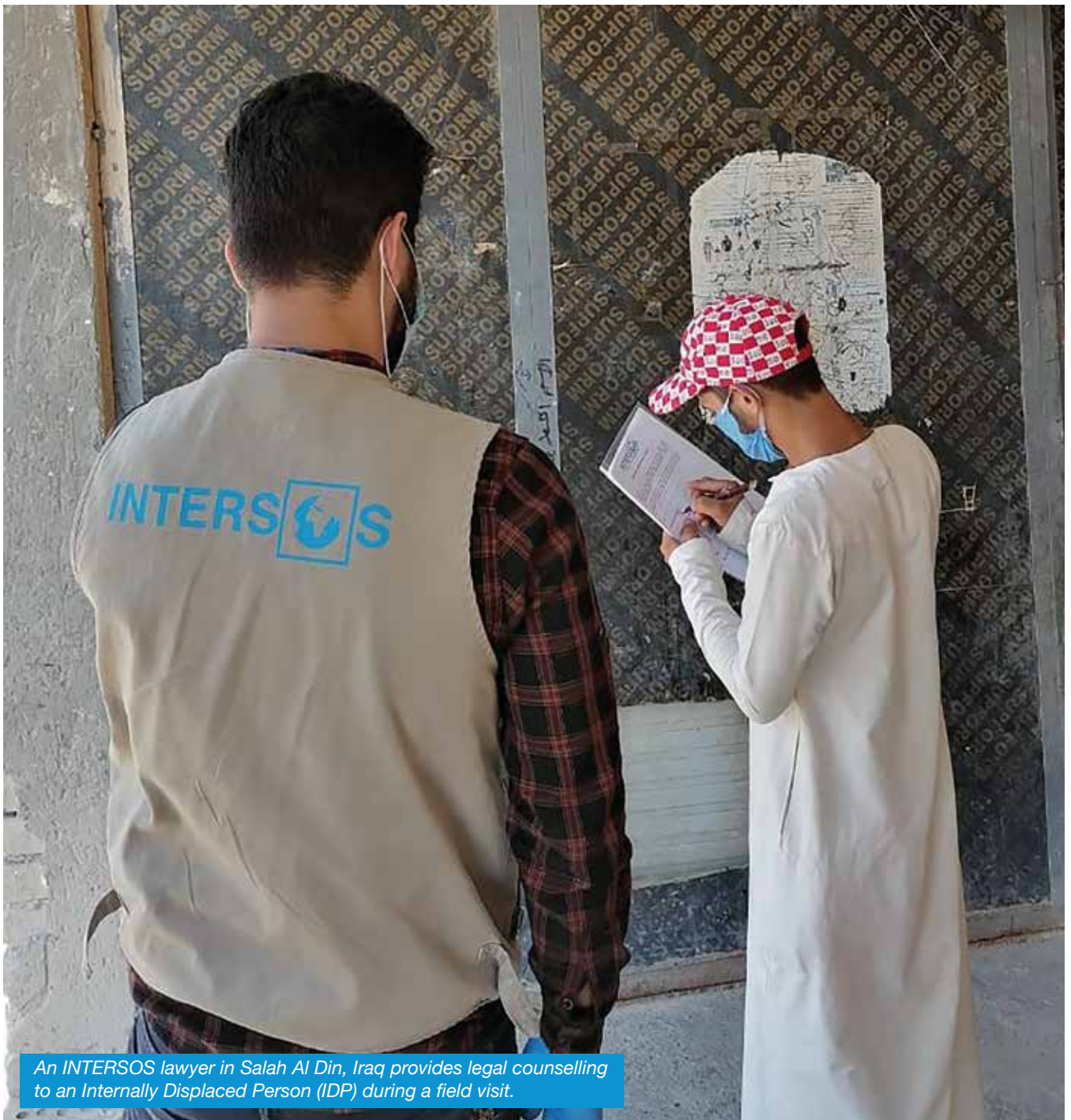
An INTERSOS lawyer in Salah Al Din, Iraq provides legal counselling to an Internally Displaced Person (IDP) during a field visit.