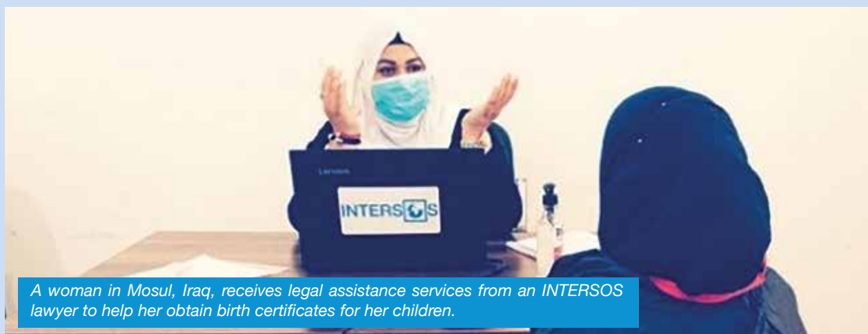
A woman in Mosul, Iraq, receives legal assistance services from an INTERSOS lawyer to help her obtain birth certificates for her children.

Two young children of a Syrian refugee family were exposed to sexual harassment and assault by their Lebanese neighbour. He had harassed and sexually assaulted many other children in the area and threatened to kill them if they told anyone. This family contacted INTERSOS through the hotline, and they were provided with legal counselling. As a result, they decided to file a lawsuit against the perpetrator and to seek a protection order to keep their children safe. INTERSOS provided ongoing support throughout to help them resolve this case and defend their children's rights. The family needed a lot of accompaniment and advice through this process, as it involved many stressful elements, such as questioning of the family members including the children, and medical examination of the children. With INTERSOS legal assistance, the family pursued this case through to its conclusion and the conviction and imprisonment of the perpetrator. This outcome provided protection not only for the children of this family, but also for all children (refugee and host community children) in the area.